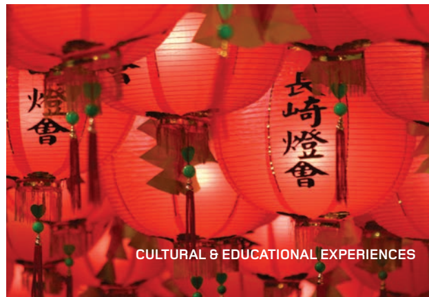
CULTURAL & EDUCATIONAL EXPERIENCES